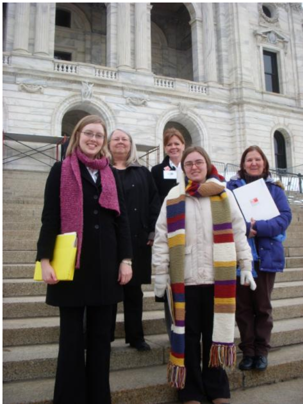
2011 Advocacy Day attendees on the steps of the Capitol