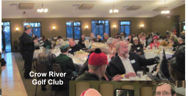
Crow River Golf Club