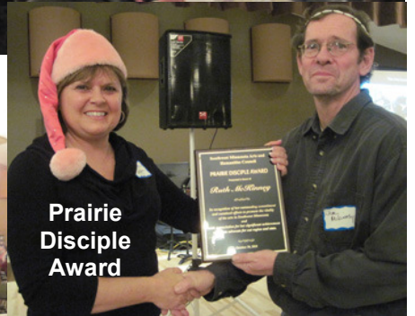
Prairie Disciple Award