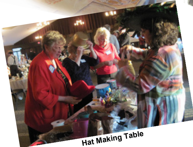
Hat Making Table