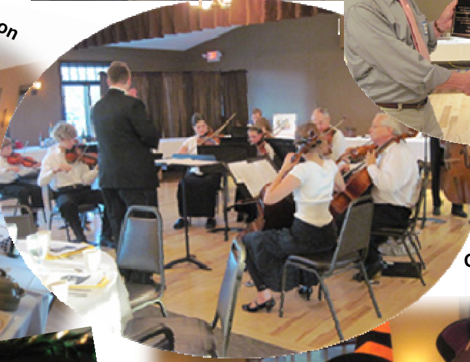
Crow River Area Youth Orchestra