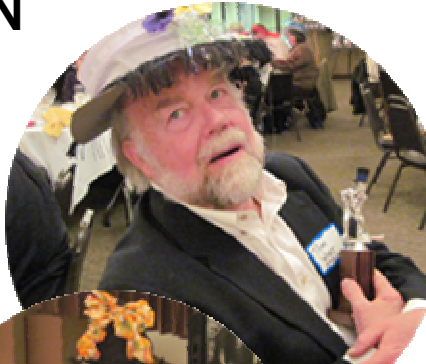
Best Hat Winners