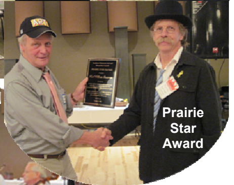
Prairie Star Award