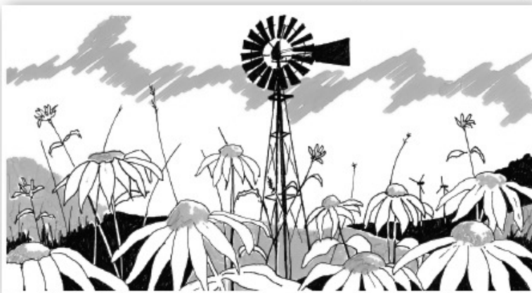
"What goes around - comes around" by 2011 Featured Artist Kerry Kolke-Bonk

Visit 33 studios featuring 45 prairie artisans!